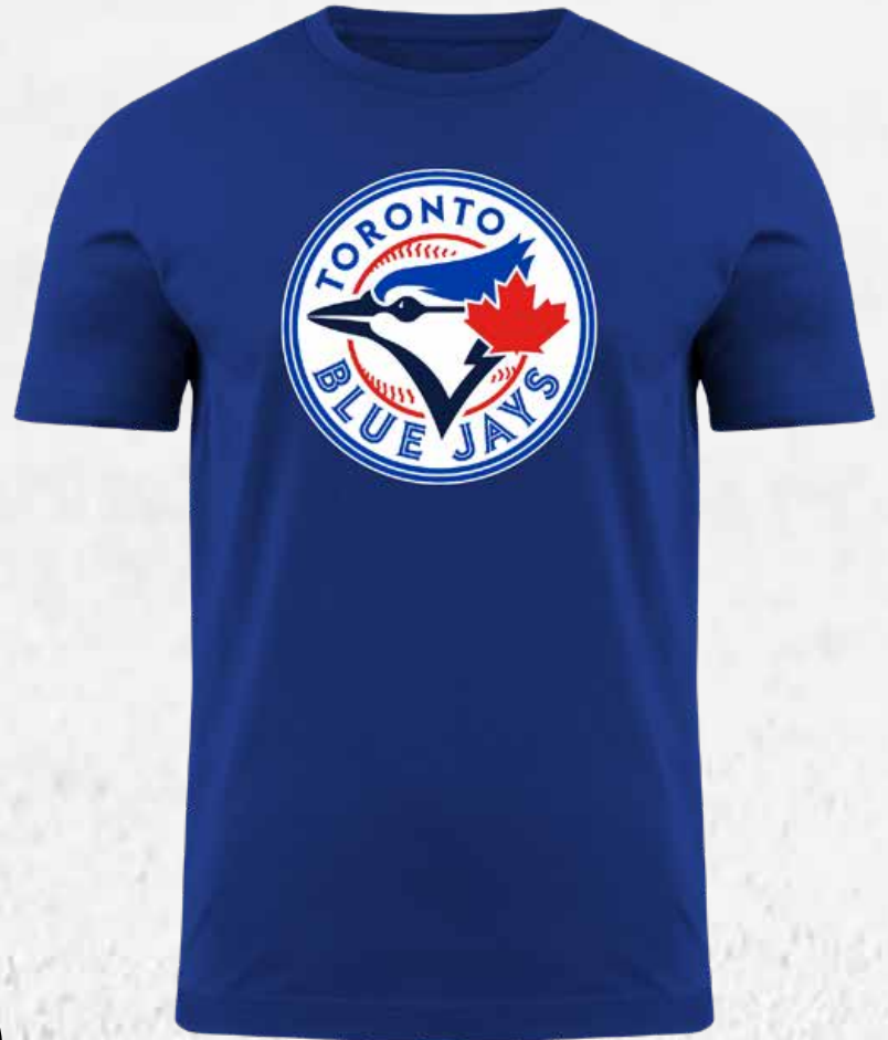
3092TBBSLG S - M - L - XL - XXL