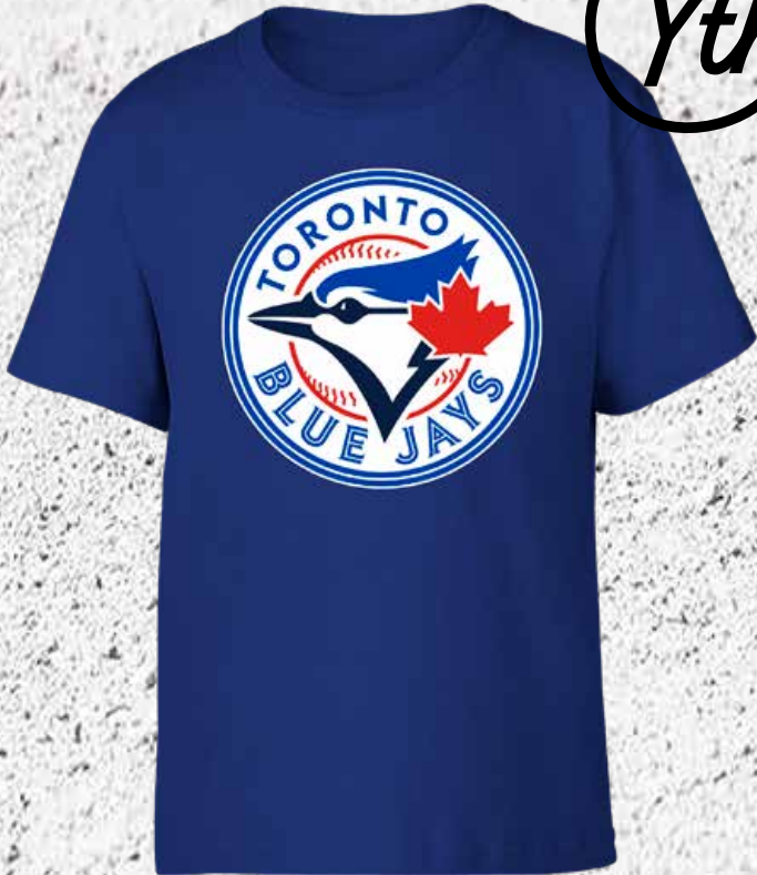
Y092TBBSLG YS - YM - YL - YXL