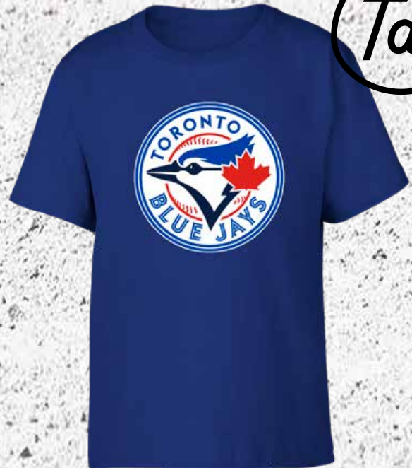
T092TBBSLG 2 - 4 - 6X